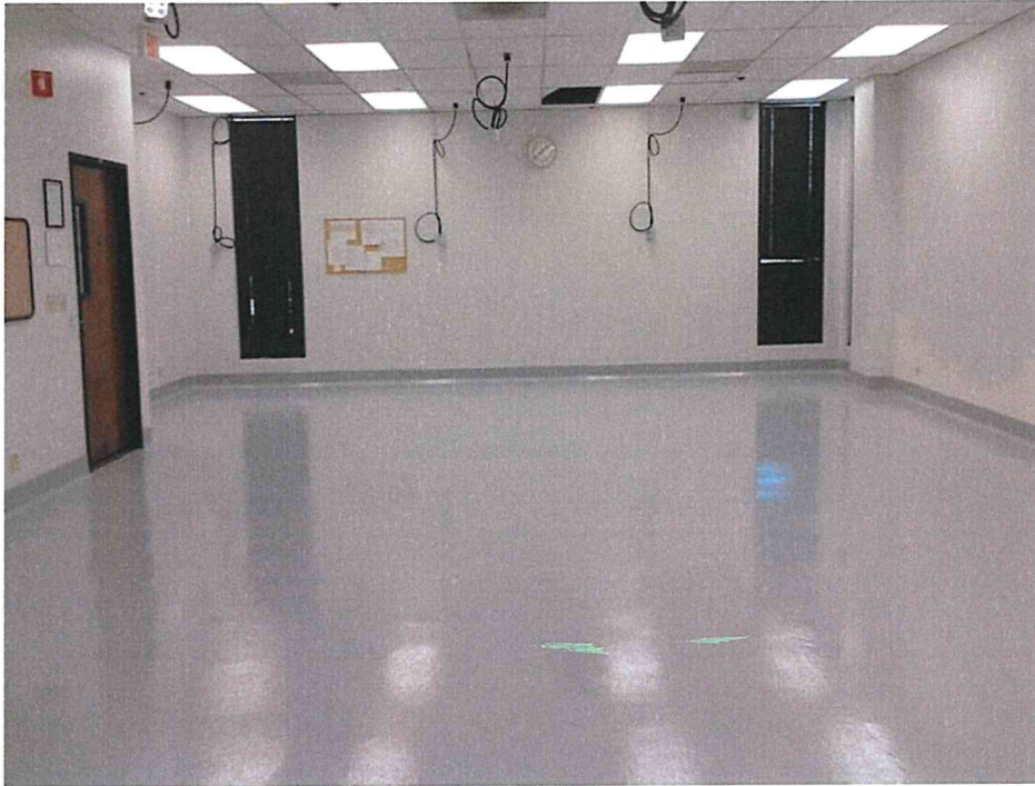
Fig. 1 Epoxy Vinyl floor