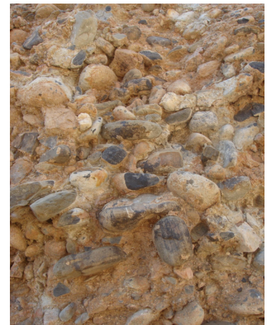
Flash floods after heavy rainfalls have been modelling the conglomerate of the canyon walls for millions of years