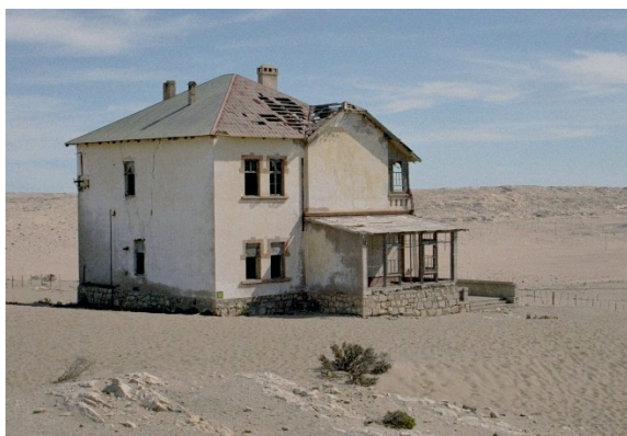
Erstwhile mine manager's residence at Kolmanskop

The alluvial diamonds found along the Atlantic coast originate in the southern African hinterland, where they formed at great depths under immense pressures before being brought to the surface in so-called „kimberlite pipes“. Leached from these kimberlites millions of years ago, the erosion products were transported downstream by the Proto-Orange River, which deposited some along its banks en route to the Atlantic - today diamond-bearing terrace gravels are mined at several localities along the Orange. Upon reaching the sea, the diamondiferous sediment was caught up by northward moving long-shore currents, which distributed the precious stones along the coast in a 100 km long narrowing zone. Concomitant with the width of the diamond-bearing sediments (3 km in the south vs. 200 m in the north), the size of the stones decreases in a northerly direction, in accordance with a weakening southerly current.