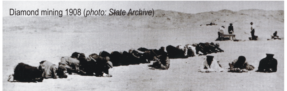
Diamond mining 1908

The alluvial diamonds found along the Atlantic coast originate in the southern African hinterland, where they formed at great depths under immense pressures before being brought to the surface in so-called „kimberlite pipes“. Leached from these kimberlites millions of years ago, the erosion products were transported downstream by the Proto-Orange River, which deposited some along its banks en route to the Atlantic - today diamond-bearing terrace gravels are mined at several localities along the Orange. Upon reaching the sea, the diamondiferous sediment was caught up by northward moving long-shore currents, which distributed the precious stones along the coast in a 100 km long narrowing zone. Concomitant with the width of the diamond-bearing sediments (3 km in the south vs. 200 m in the north), the size of the stones decreases in a northerly direction, in accordance with a weakening southerly current.