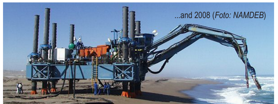
...and 2008